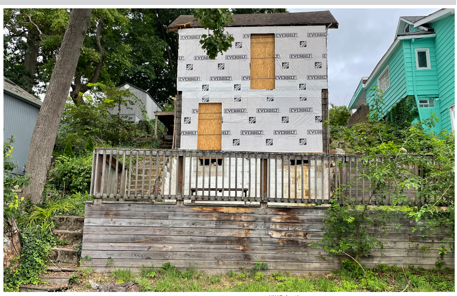
Information is believed to be accurate but not guaranteed. KIKO Auctioneers

Directions: From Portage Lakes Dr. take Saunders Ave. west to Mong Ave. Watch for KIKO signs.